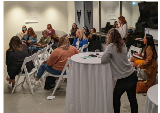
Intrapreneurship: Startup Women