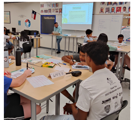
SLAM Bootcamp: 4th Grade Summer Camp