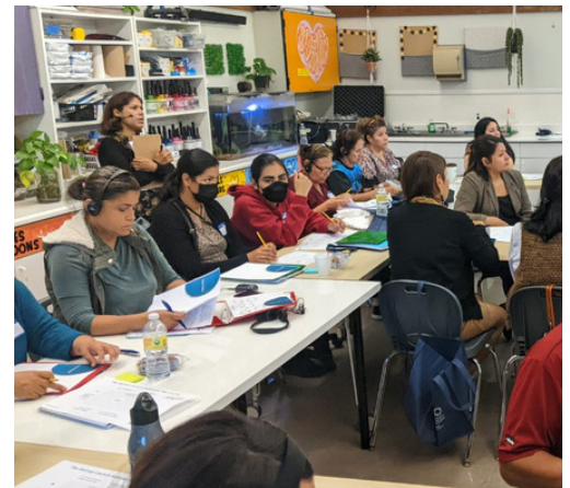
SLAM Bootcamp: Daycare (English/Spanish)