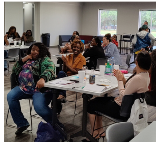
SLAM Bootcamp: Texas A&M